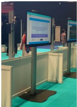
← Our poster 'in the wild' at the conference!