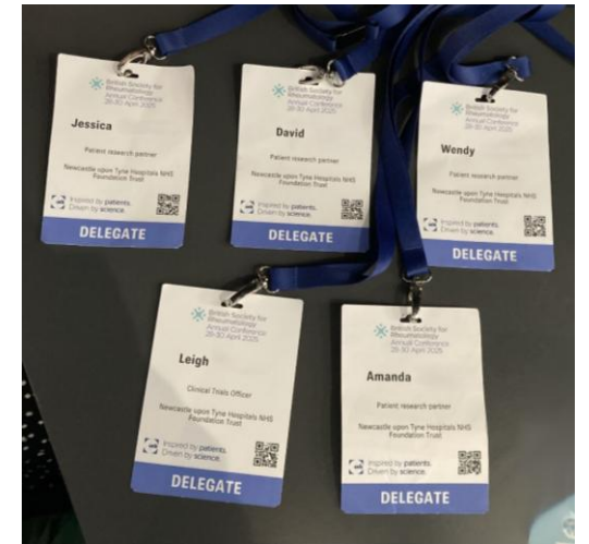
Above – Our delegate ID passes!