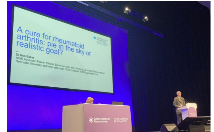
Ken Baker presenting on the main stage!

Inside the venue – lots of stands from charities and drug companies →